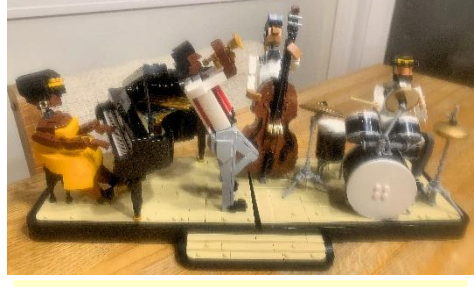
We be jamming!

-imposed fallow years, The Beat Goes On Marching Band (TBGO) ramped up to two