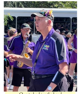
Quarterbacking the band

on the plus side we get to visit the Oregon Dairywomen's booth for an ice cream fix every night between shows.<sup>6</sup> We figured the odds of anyone in the band catching Covid were low since the Fair is all outdoors, but we still feel a bit lucky to have made it out of that petri dish of humanity unscathed.