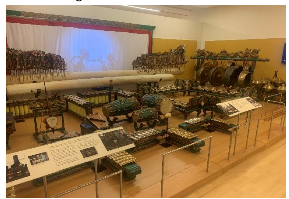
A gamelan orchestra

the show we traipsed<sup>11</sup> over to the Council Chambers at Portland City Hall where we played a couple of tunes for the swearing-in of Portland