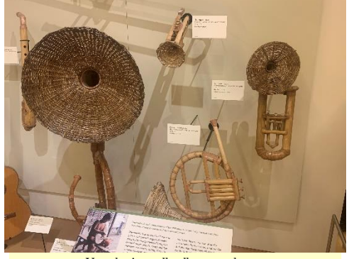
Yep, they're really all oversize kazoos

The band finished off the year with a two-fer, beginning with a holiday concert in Pioneer Courthouse Square