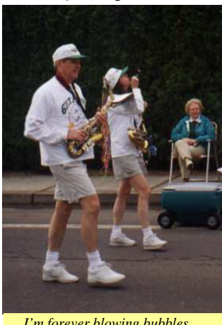
I'm forever blowing bubbles ...