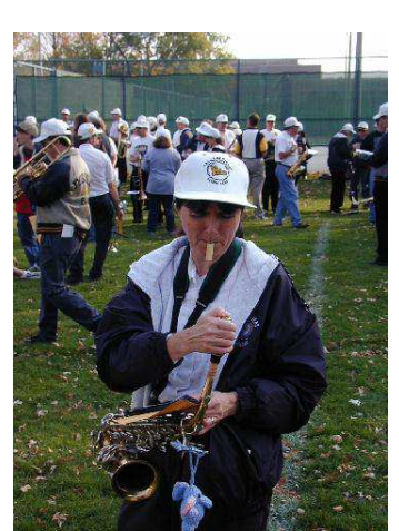
Rehearsing the halftime show