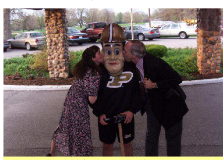
Purdue Pete – our hero!

by a whole evening of reminiscing. Dozens of letters from friends and family were read aloud sharing good wishes and stories of "the olden days," some of which left me pretty darned mistyeved. It is un-